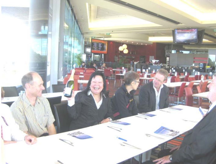
Celebration at the AoZoo Book Launch Event on 17th Oct