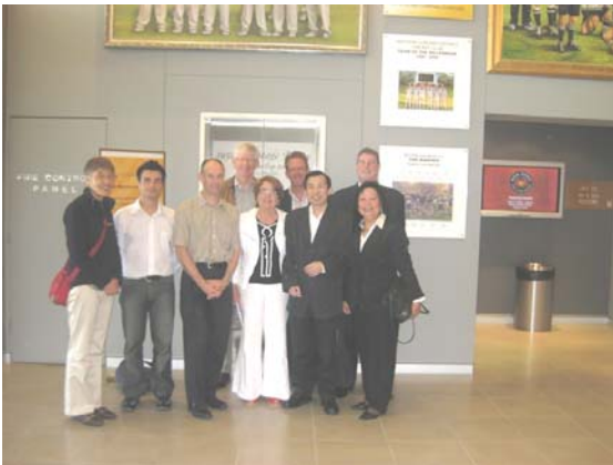
The AoZoo Book Launch Event on 17th Oct

The reason I wrote this book was that I found a fact that most people who I knew of, Australians, Chinese Australians who had lived in Australia for a long time and even those who were regarded as Chinese experts, as well as a significant amount of local Shanghainese who had lived in Shanghai, only possessed limited knowledge about what Shanghai was really like, and there was no book in the marketplace to provide some simple facts, such as why Shanghai is a culture centre of China, why it was the Wall Street of Asia etc, etc. Those facts had motivated me to write this book up as a reference for Australians. When writing this book, I had the support from a number of Australian native writers this book might appeal to.